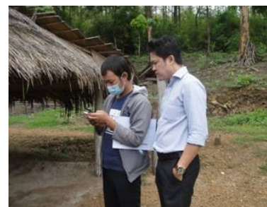
PoiMapper field use in Chiang